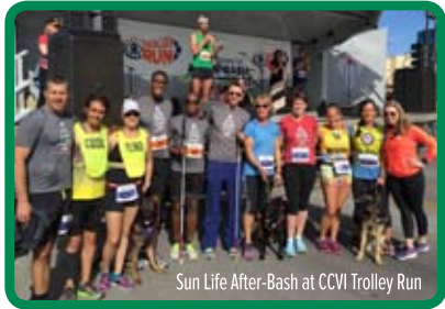
Sun Life After-Bash at CCVI Trolley Run