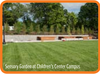
Sensory Garden at Children's Center Campus

It was a busy year at CCVI this past school year. We made some great improvements to our preschool at 31st and Main. The KC Street Car Constructors selected our proposal and built an incredible Sensory Garden that serves the entire Children's Center Campus. CCVI students love having a big open green yard to run and play in, raised garden beds in which to plant herbs and pumpkins, and a walkway with different surfaces to explore with their canes and wheelchairs. We also installed a sunshade over the central courtyard playground of the Campus. A grant from the American Dermatology Association helped make this possible, as well as considerable help from our friends at Helix Architecture and Belger Cartage Service . Finally, our wonderful friends at Hufft Projects also helped renovate all the CCVI classroom sinks so that they are more accessible to our students using wheelchairs.